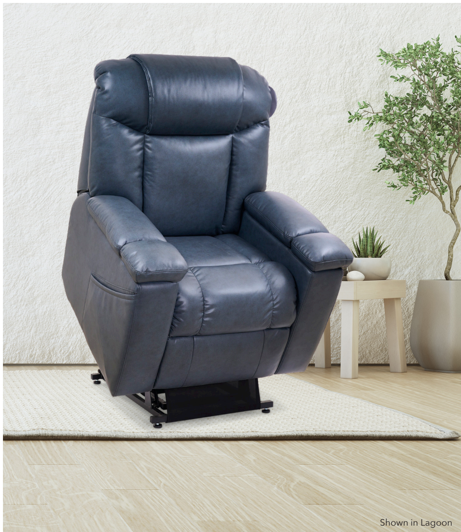
Shown in Lagoon