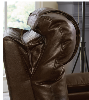
Adjustable Headrest & Lumbar