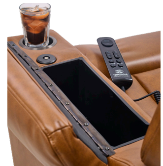
Left Arm: Cup Holder, Power Port & Storage Compartment