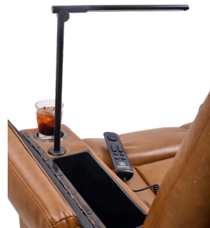
Power Port + LED Reading Light