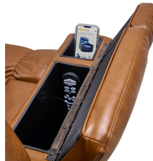
Right Arm: Wireless Charger & Storage Compartment